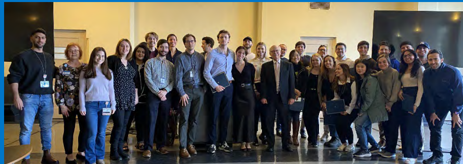
B&CSCO 2024 CLASS

January 6 – January 31, 2025 New York, New York