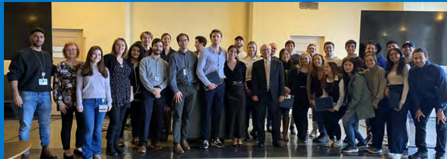
B&CSCO 2024 CLASS

January 6 – January 31, 2025 New York, New York