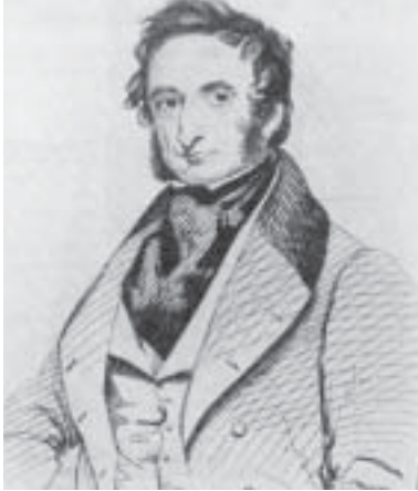
Robert James Graves

In 1835, Irish physician Robert James Graves described a puzzling protrusion of the eyeball affecting many women diagnosed with thyroid abnormality. The condition has been called Graves' disease ever since.